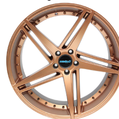
4334 Metallic Bronze tinted 15% per vol. with 4662 candy 2 O Dirt Track Brown

Airbrushing: 4200 Series Colors work best for airbrush colors. Dilute generously with a mix of both 4030 Balancing Clear and 4012. Generally, an equal mix of paint / 4012 / 4030 Balancing Clear works well. Exact ratios are not required, what is important is atomization. Add enough 4012 to achieve optimum atomization with each color.