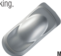
6013 AutoBorne Silver Sealer